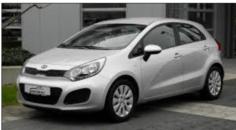
10. Make & Model