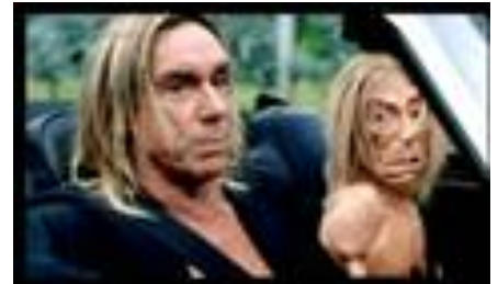
21. TV Ad