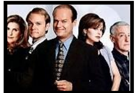
6. Classic TV