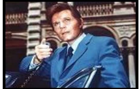
6. Classic TV